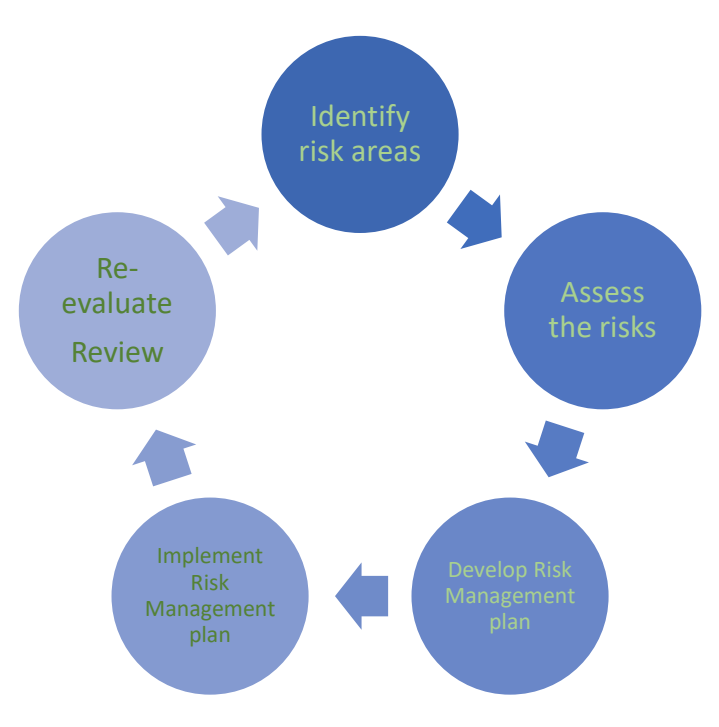
Risk Management Cycle